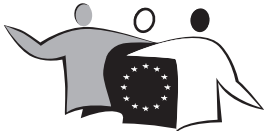
2007 - European Year of Equal Opportunities for All

For a reduction to less than 50%, the body of the text will be a minimum of 6 pt. The text will be centred below the logo.