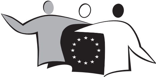
2007 - European Year of Equal Opportunities for All